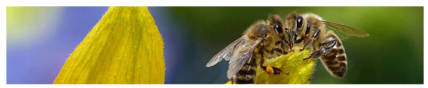
<sup>2</sup> Health Canada. Proposed Re-evaluation Decision PRVD2016-20, Imidacloprid. November 23, 2016.