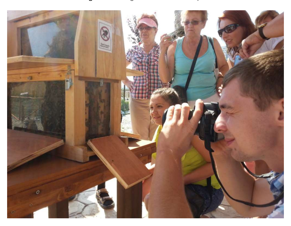
\textbf{Image 5.} \ \textbf{Observation hives: clear view of honey bees working in a safe distance}