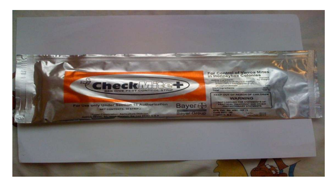
Box of fake CheckMite + manufactured by a Middle Eastern country

Furthermore a product from an unknown country under the name of CheckMite+ is sold on the black markets of the majority of Near East and Middle Eastern countries. The active molecule is para-dichlorobenzene plus another unknown molecule. The fake CheckMite+ can contaminate hive products and is dangerous to beekeepers. These strips are light yellow and thin. See photos below.