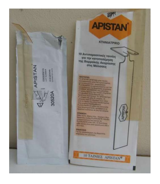
Apistan (active molecule: Fluvalinate 800 mg) from Vita Europe

Furthermore a product from an unknown country under the name of CheckMite+ is sold on the black markets of the majority of Near East and Middle Eastern countries. The active molecule is para-dichlorobenzene plus another unknown molecule. The fake CheckMite+ can contaminate hive products and is dangerous to beekeepers. These strips are light yellow and thin. See photos below.