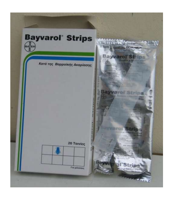
Bayvarol (active molecule: Flumethrin 3.6 mg) from Bayer AG