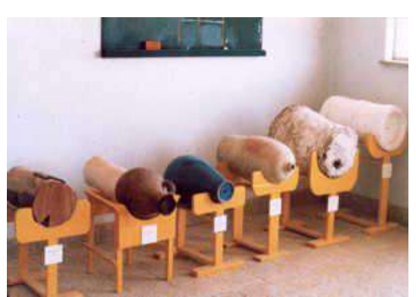
collection traditional hives in Iran

Traditional hives are made of clay pottery, wood (tree trunks) or wicker (willow branches).