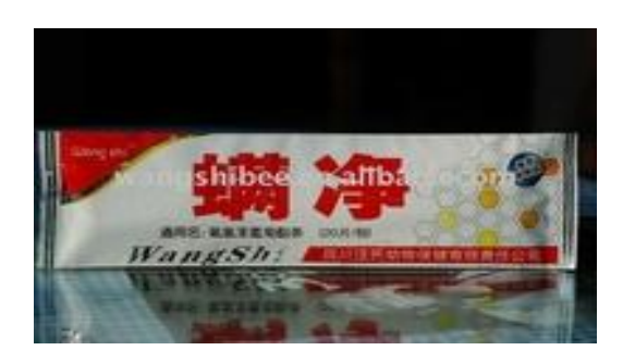
Wang's Flumethrin Strip

This has allowed them to test the effectiveness of different treatments and their mode of action on parasites: inhalation (fumigation), absorption (systemic), or contact and evaporation. Since 2008, products from China have been sold on the black market without veterinary authorization in the Near Eastern countries and also without permission from Bayer Healthcare AG. These products are pictured in the following photos: Wang's Flumethrin strips and Wang's Fluvalinate strips.