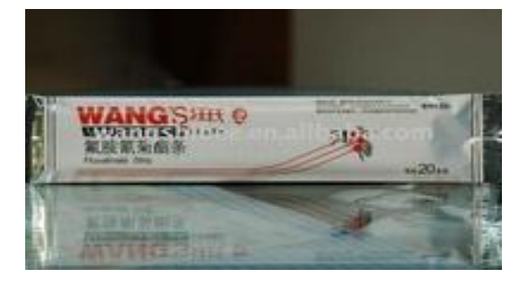
Wang's Fluvalinate Strip