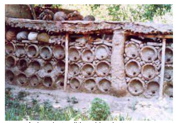
Apiary in traditional basketry

For around five decades, the use the frame hive has grown and the majority of beekeepers are able today to manage modern frames hives. However, harvesting honey from wild colonies has not completely disappeared. Everywhere bees are still nesting in old trees, or in holes dug in the rock or in caves.