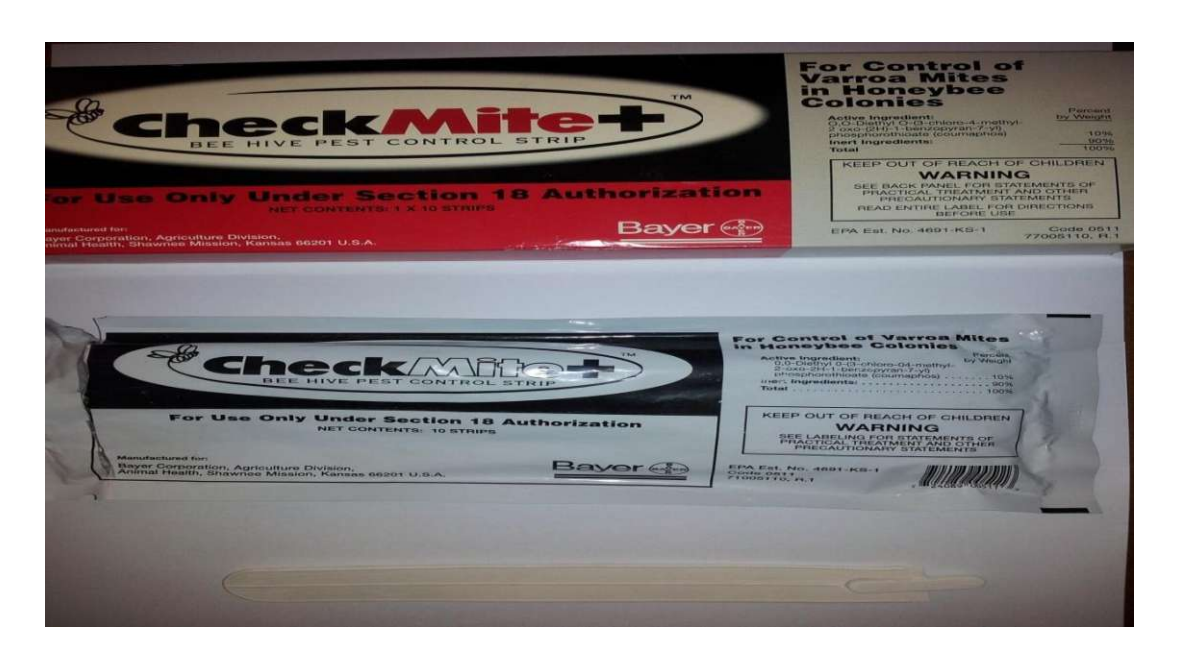
Box of genuine CheckMite + produced by Bayer AG