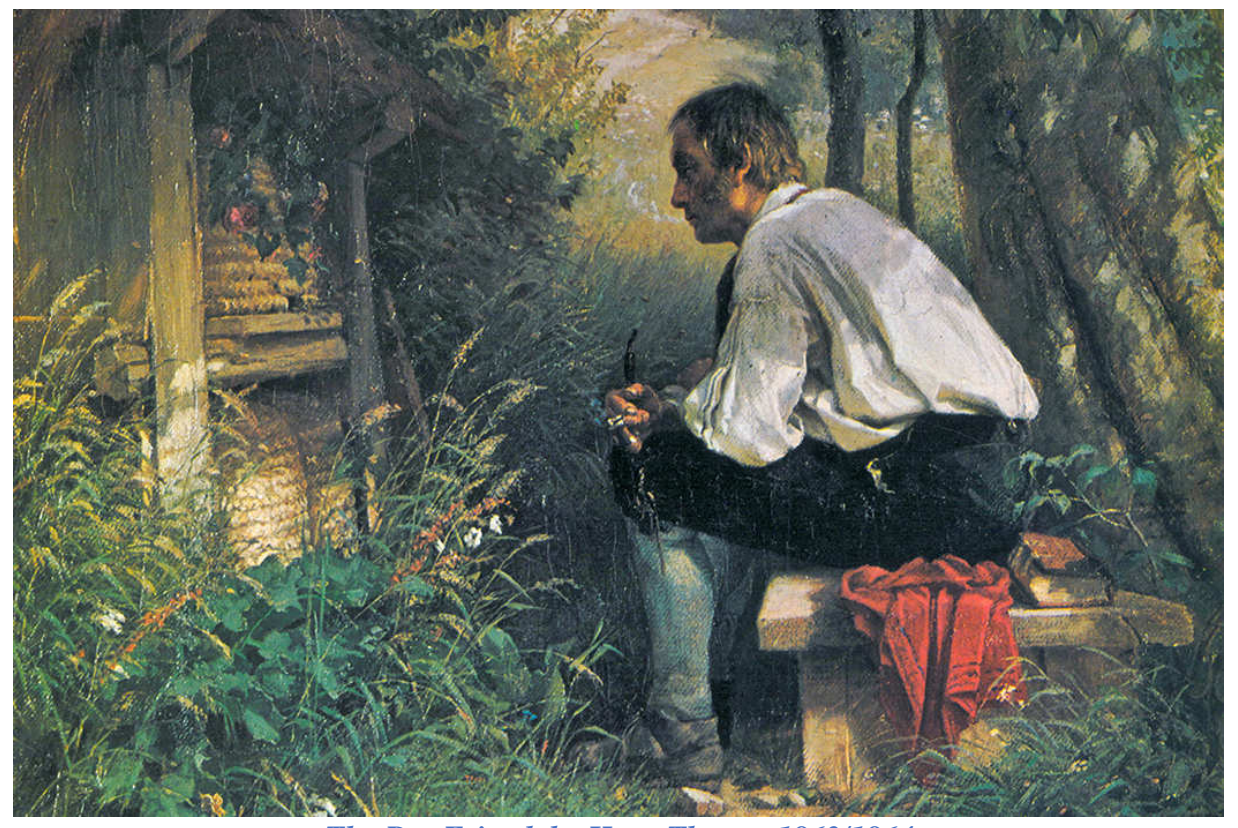
The Bee Friend, by Hans Thoma, 1863/1864

In nineteenth-century New England, it was held to be essential to whisper to beehives of a loved one's death.