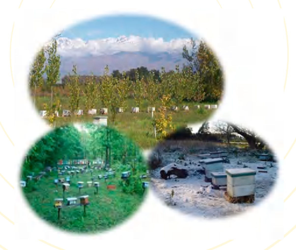
Figure 2: Diversity of environments for beekeeping inLatin America

Meliponiculture is performed mainly in the tropical-subtropical regions meanwhile Beekeeping is performed in a wide range of climates including the most southern region of the world (Figure 2).