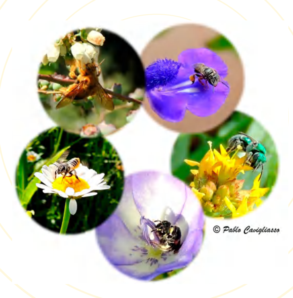
Figure 1- Latin America hosts a large diversity of bees including solitary as well as social species such as stingless bees and honey bees.

The Latin American and the Caribbean region have a great variety of climates, since it covers southern and northern hemisphere. The tropical, subtropical and temperate climates present in the region determine a rich and varied vegetation which support a great diversity of pollinators, including solitary and social bees (Figure 1). Stingless bees together with honey bees, attain the highest level of sociality among the superfamily of the Apoidea. Stingless bees are native in Latin America (LA) and include a large diversity of 300 species over 30 genera (from 400 described species worldwide) (Velthuis 1997). In particular, LA hosts the most primitive genera of stingless bee such as Plebeia, as well as the most evolved ones like Scaptotrigona and Melipona.