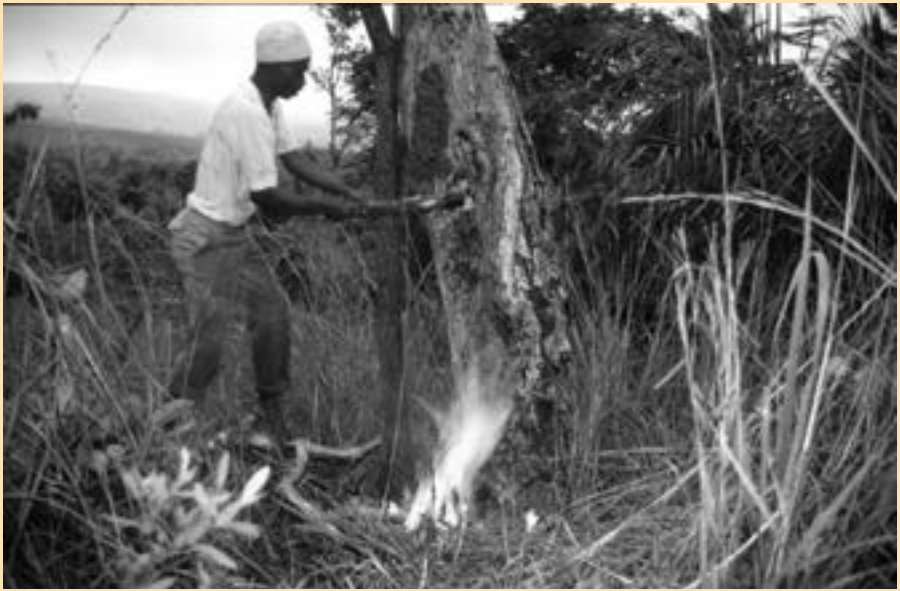
FIGURE 2 Farmer fells a tree to get at a beehive in its interior