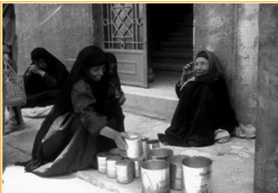
FIGURE 17 Women selling honey in Egypt

in terms of bee products, quantities required and quality, but small-scale farmers have access to such markets and are able to compete with other small-scale farmers who are also selling bee products.