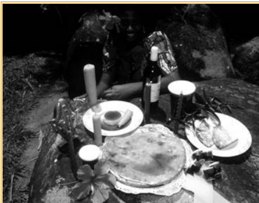
FIGURE 7 A selection of products made from honey and beeswax

Processing is not only important for higher incomes, but also for food security and availability. Bee products that have been appropriately processed are available year round for farm family consumption, but also for consumption by customers in local communities