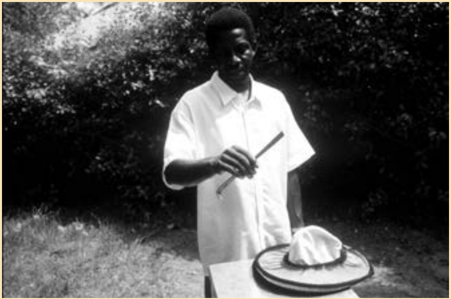
FIGURE 16 This hive tool is used to lift hive frames and help in other management practices. The hat with veil protects the worker from bee stings