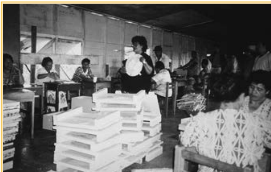
FIGURE 9 A women's group assembles beehives as part of an effort to provide a new source of income for the village

Beekeeping can also create social benefits as for example when small-scale farmers join together to form an association, either formal or informal. This collaborative work, which fits in very well with beekeeping, especially during honey harvest time, can create scope for working together within a community and the people involved can see and experience the advantages and benefits of collaboration and social harmony.