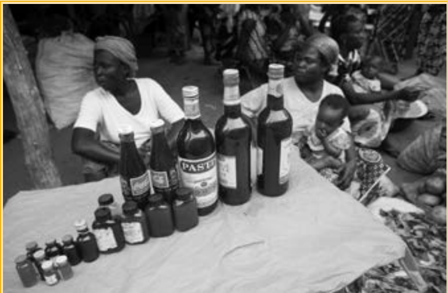
FIGURE 1 Vendors selling raw honey in a variety of recycled bottles at a market

knowledge required for such an enterprise are found within local traditions. As a business enterprise it offers not only diverse products, for example honey and wax among others, which can be sold in local markets and become an important source of regular income for farm families, but can also provide complementary services, such as crop pollination. Moreover bee products improve farm family nutrition and can provide for traditional health care remedies.