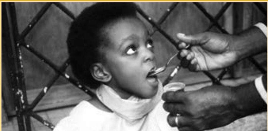
FIGURE 6 A child being fed honey (Photo: FAO/19179/M.Marzot)

Source: CTA. 2005. Bee products; properties, processing and marketing , Agrodok No. 42, Wageningen, the Netherlands