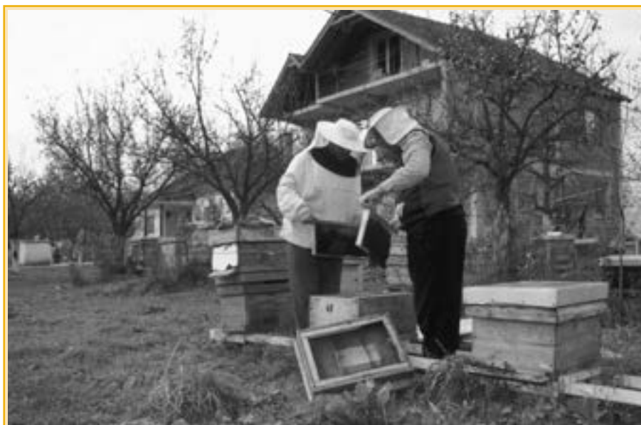
FIGURE 5 Small-scale farmers checking their hives in proximity of the farm homestead

travel far to tender the enterprise and it can be a ready source of cash in times of need, as bee products can be sold to neighbours or in local markets. This enables women to be part of an economic activity, which can provide them with income and an independence that can support them in difficult times. It is also a flexible activity, where there is no need for constant tending, for example as with livestock and crops, and hence allows women to follow other matters on farm as well.