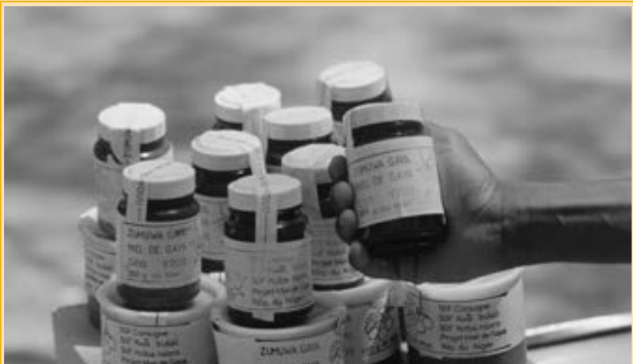
FIGURE 8 Pots of honey on sale at a roadside market in Niger

In some countries there are charges made for pollination services carried out by bees on commercial crops. This has a value for the commercial crops as not only it increases yields, but also increases quality of the crops. This means that there is potential to charge fees for pollination services carried out by small-scale farmers' bees in their local areas.