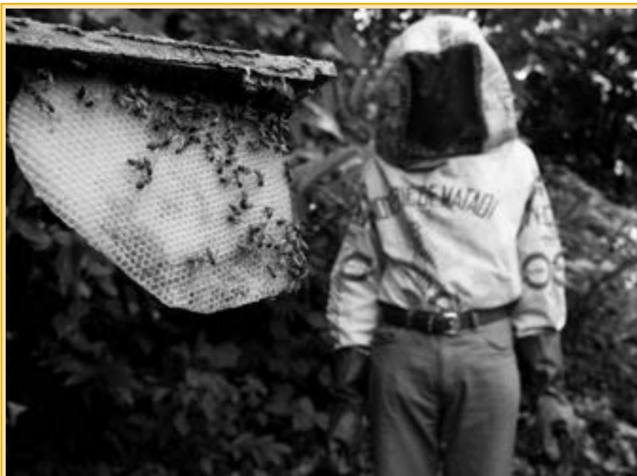
FIGURE 10 Bees on an unprotected comb in the Democratic Republic of Congo