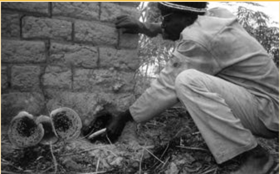
FIGURE 3 Removing honeycombs from a hole in a wall