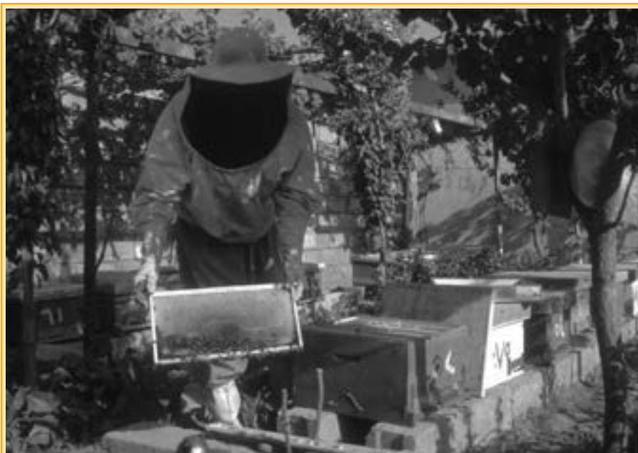
FIGURE 4 Beekeeping: increased populations of honeybees are required for optimal pollination of food crops and for the production of increased quantities of honey

Beekeeping is a lucrative trade even using simple management