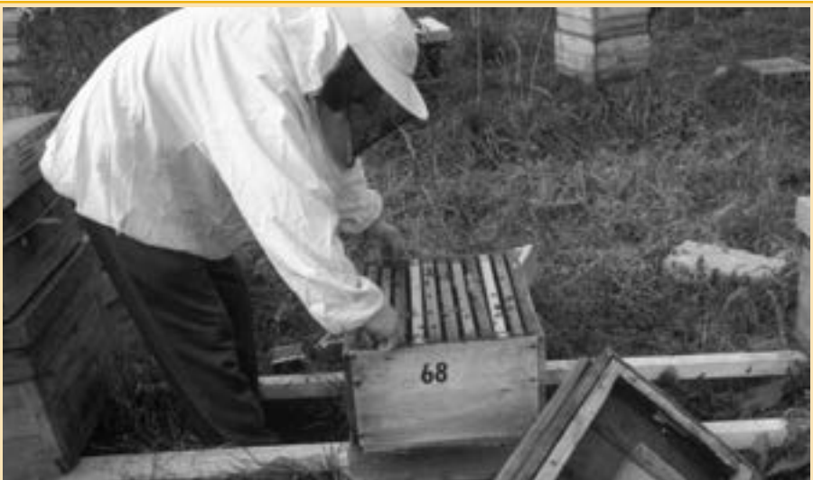
FIGURE 15 A small-scale farmer wearing protective clothing is checking on progress of hibernating bees after putting warm smoke in the boxes to wake them up. He is not wearing gloves because the bees were hibernating and there was no danger of being stung