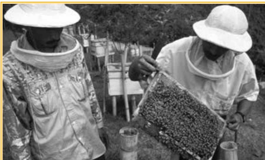
FIGURE 13 A movable hive frame in Nepal. Beekeeping is a new activity in the Shivapuri area. The aim of the FAO project is to improve the economical situation of the local people by developing income-generating activities

This ensures that honey alone is stored in boxes above the queen excluder and allows for an efficient honey harvest. In addition to the boxes and frames, a floor and roof are required, along with various other specialized items of equipment. Frame hive equipment should not be used unless the infrastructure exists for manufacturing it locally. Frame hives require well-seasoned timber, planed