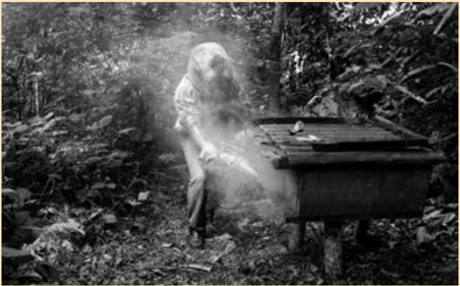
FIGURE 14 Smoking a hive for inspection and/ or harvesting of honey