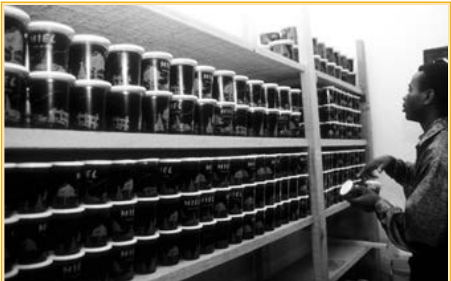
FIGURE 18 Honey being sold in plastic and transparent jars, with a logo and label printed on them

Marketing bee products that have been processed requires packaging. Typically in local areas small-scale farmers use whatever they can find, for example recycled bottles and jars. In such cases it is important that not only the packaging is clean and free from odours and consumers can see the bee products, for example the colour of the honey, but it is also not excessively heavy. For example recycled glass jars are heavy and may break if stacked and/or improperly handled. Plastic containers may be preferable, but may be difficult to obtain. Importantly whatever the