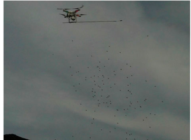
Figure 2. Phantom 2 Vision UAV rising to investigate any height limit to drone activity.

The UAV (Figure 2), can fly up to 15 m per second (54 km/h), in any direction, and it can fly in winds up to 27 km/h, enabling it to fly any conditions in which drone bees fly. It is not affected by strong gusty winds due to its GPS positioning system which prevents it moving in